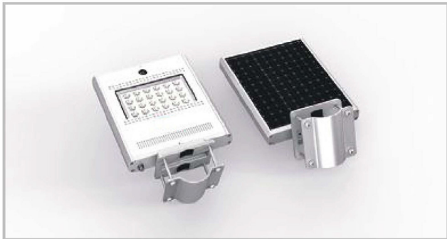
■ 10W, 15W